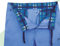
CELL BLUE W/ NAVY TRIM