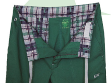
TREELINE GREEN W/ TITANIUM TRIM