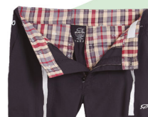
ECLIPSE BLACK W/ TITANIUM TRIM