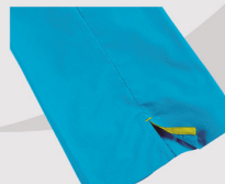
OUTSIDE HEM PANT SLIT