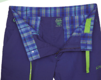
NEWPORT NAVY W/ IGUANA GREEN TRIM