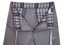
CITY SLATE W/ TITANIUM TRIM