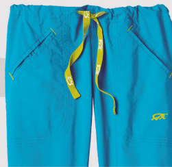
CONTRASTING DRAWSTRING & DEEP WELT FRONT POCKETS