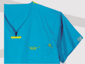
CONTRASTING TRIMS & IGUANA LOGO

High end construction includes Triple reinforced drawstrings, badge loops, and pockets inside of pockets detailing.