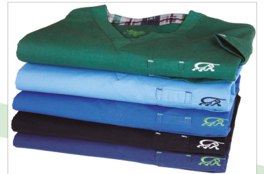
CONTRASTING BARTACKING AND LOGO