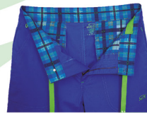
AZURE BLUE W/ IGUANA GREEN TRIM