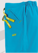
HALF ELASTIC / HALF DRAWSTRING WAIST